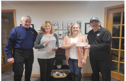
Lakes Life Care Donation