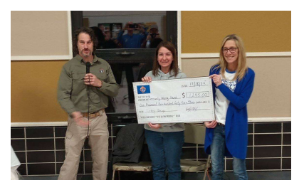
Turkey Bingo 2023 Big Check Presentation after turkey bingo, together over $1300 was raised for our local Community Helping Hand food shelf